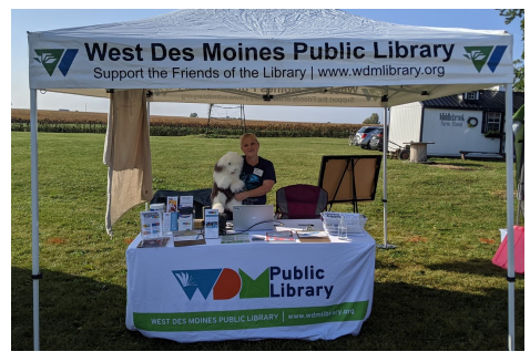
Outreach at Fall Fest at Middlebrook Farm, October 2021