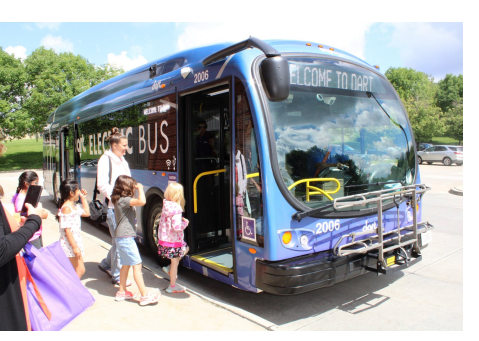
DART Storytime, June 2022