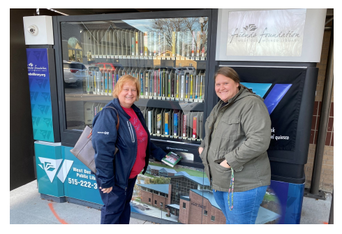
Patrons visit the 24-hour Valley Junction Kiosk, November 2021