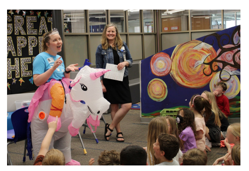
Summer Reading school visits, May 2022